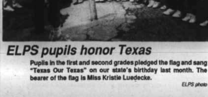
ELPS pupils honor Texas

*Yield assuming principal and interest remain on deposit at current rate for one year. Rates are subject to change without notice. Penalty for early withdrawal. FDIC insured.